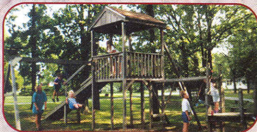
Shaded park-picnic-playground area.