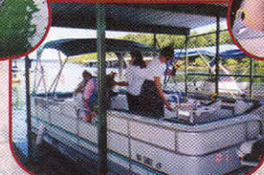
Private, lighted, covered dock with Swim Platform-Boat Rentals