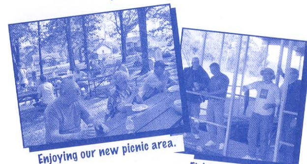
Enjoying our new picnic area.