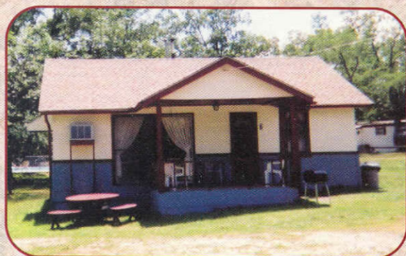
Spacious cabins with private bedrooms.