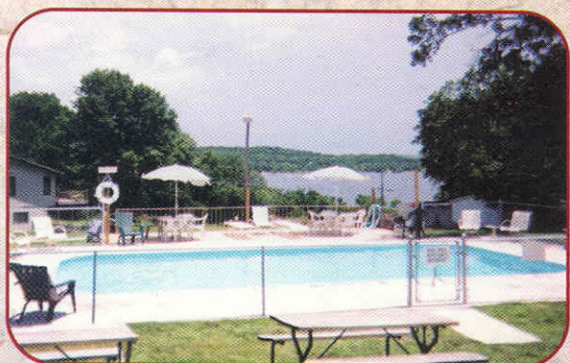
Pool side relaxation or take a swim!