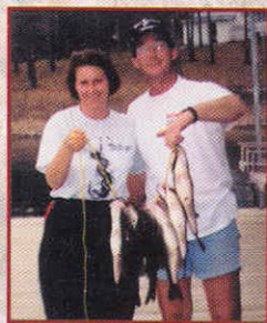
"Fishings Great Year Round"